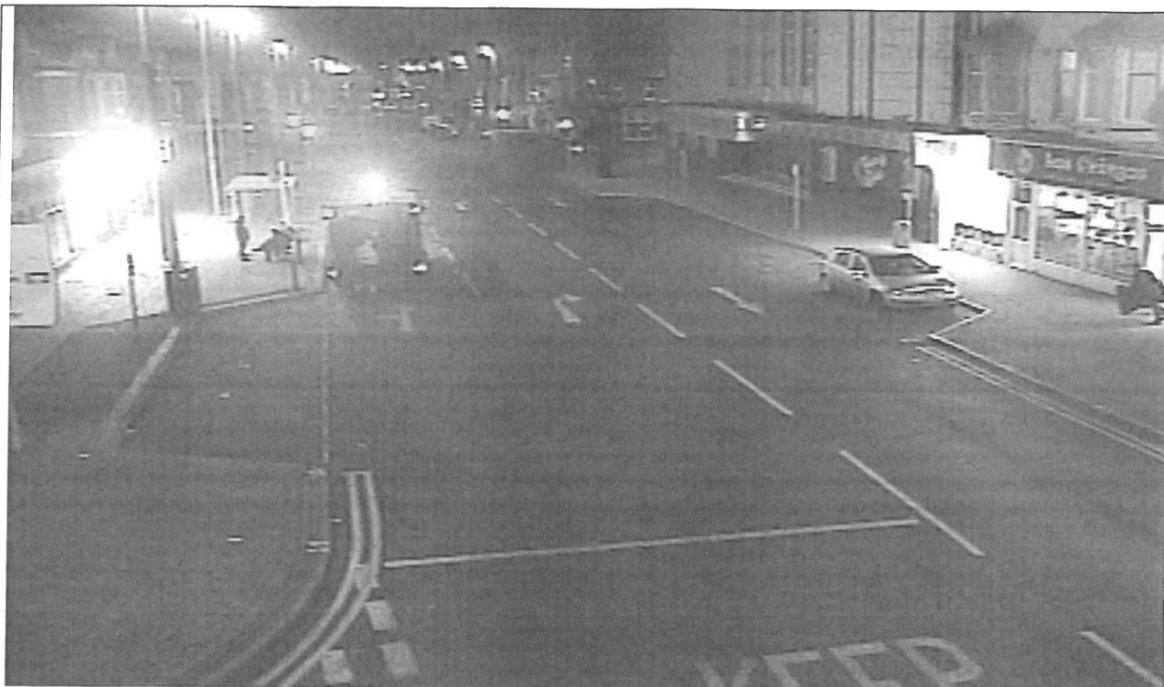
At 06.34hrs on the 25 th of January 2015 member of staff observed leaving Los Gringos with waste sacks (black bags).